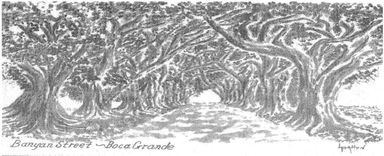
Photo from postcard art by Leo Patten

Located in the beautiful historic district, Banyan Street is a signature icon on Gasparilla Island (Boca Grande). The graceful beauty of huge trees canopied tightly over a narrow street is truly village like. The fig trunks are nearly grotesque in form, twisting their way up and down. Large aerial roots drip down from above. Those roots that reach the ground add support to the heavy branches. This island street is a special place, worthy of attention and protection.