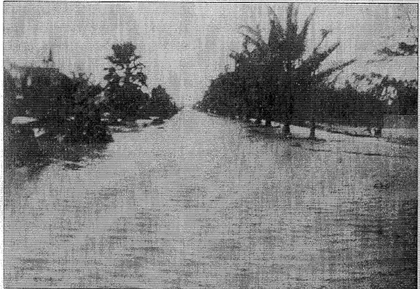
This downtown street, probably Gilchrist Avenue, flooded in the 1921 storm.

By existing 88 years, these trees have been exposed to no less than 4 hurricanes or tropical storms. Typical conditions of these tropical storm events that would have impacted these trees include high winds, Gulf of Mexico salt spray and salt water inundation from tidal flooding. This photo shows the flooding effects and ponded Gulf of Mexico water of the 1921 hurricane that hit Boca Grande.